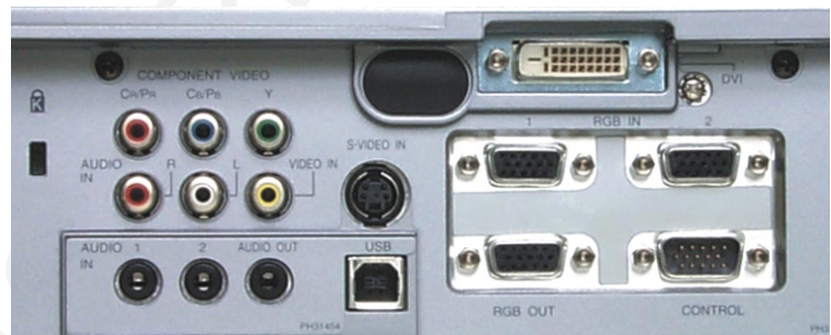
The ImagePro 8910 inputs are easily accessible.

If you are looking for a versatile projector to handle the classroom, training room, conference room, halls or churches, the XGA ImagePro™ 8910 is the projector for you. Bright enough to handle demanding, large audience presentations, yet small enough to easily carry around. The 8910 has a wide set of features that will satisfy virtually every user. In addition innovative new features such as Horizontal and Vertical Keystone correction plus a "Custom Image" programable startup screen further increase the usefulness.